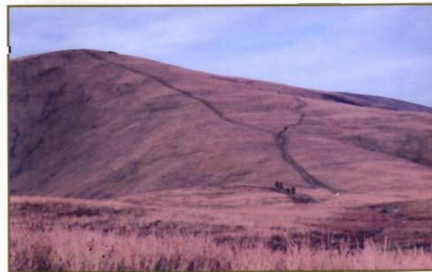
View from Winder to Arrant Haw