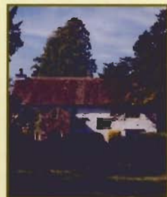
Friends Meeting House

Walk down the road with a bungalow on your left to the first house on the left (Newfield Farm). Turn sharp left down the lane and then right over a stile down two small fields, over a small concrete bridge then right, down through the gate and make for the big tree on the left, then follow the line of big trees downhill to the stile into Hawkrigg Wood (you may see roe deer and a large badgers' set in the wood). Go over the road onto the path to Lincoln's Inn onto the road and over the bridge.