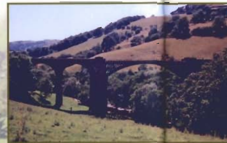
Viaduct near Low Branthwaite

For a more detailed map we recommend that you use the OS Explorer OL19 Map